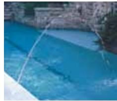
Single 5/16" Stream