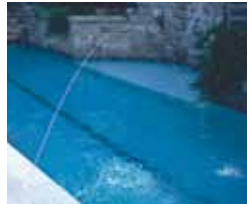
Single 1/4" Stream