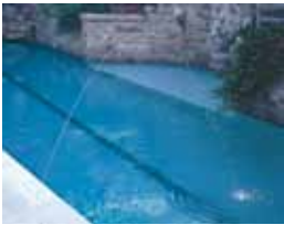
Single 3/16" Stream